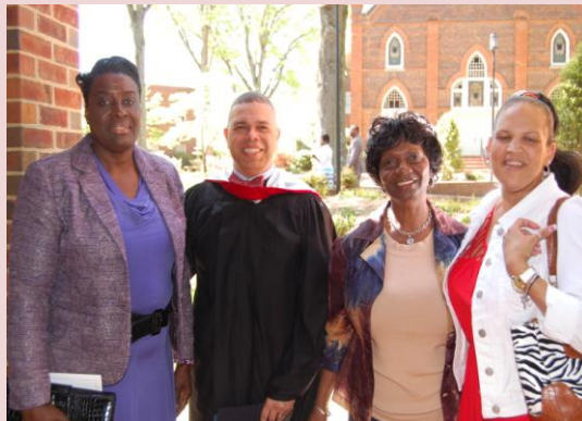
Seminary Graduation - Thank you Jesus!